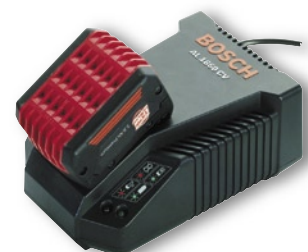
Charger and two batteries included