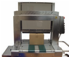
Optional Press Assembly