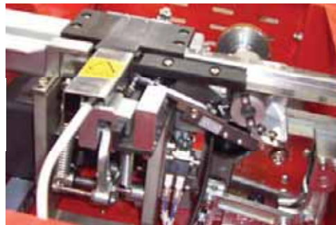
P205 Heavy Duty Seal Engine