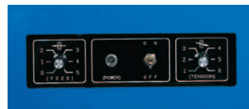
P100 Strapping Machine Control Panel